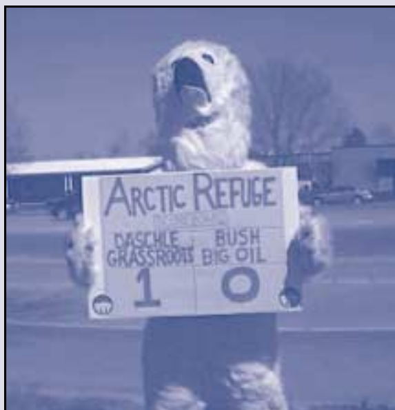
A polar bear greets President Bush in South Dakota with an Arctic Refuge Scoreboard.

threats, as detailed in this newsletter. For these reasons the Alaska Coalition needs your help now more than ever to help protect our last best place.